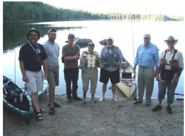
The Willard Pond Field Meeting was well attended.