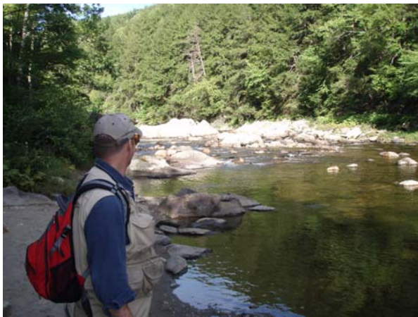
A small contingent explored the Westfield River in Mass.